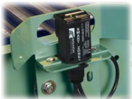
PHOTO SENSOR MOUNT

DEFUSED SMARTZONE: Photoeyes mounted below tread rollers.