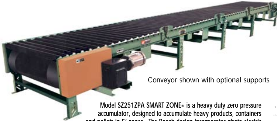
Conveyor shown with optional supports

Model SZ251ZPA SMART ZONE® is a heavy duty zero pressure accumulator, designed to accumulate heavy products, containers and pallets in 5' zones. The Roach design incorporates photo electric sensors--instead of sensor rollers, eliminating many common problems associated with conveying wooden pallets. Products do not touch during accumulation and are singulated individually off of conveyor. Heavy loads weighing up to 3000 lbs. may be safely accumulated with Roach SMART ZONE®.