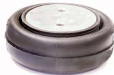
HEAVY DUTY AIR BAG