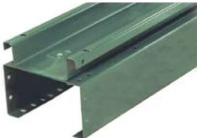
DETAIL OF INTERMEDIATE BED SECTION

ELECTRICAL CONTROLS: Magnetic starter (one direction or reversible); One direction manual starter; Momentary start/stop push button station; Forward/reversing /stop push button station. Mounting and pre-wiring for units up to 12' long.