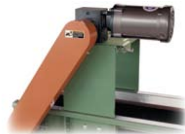
OPTIONAL OVERHEAD MOUNTED DRIVE